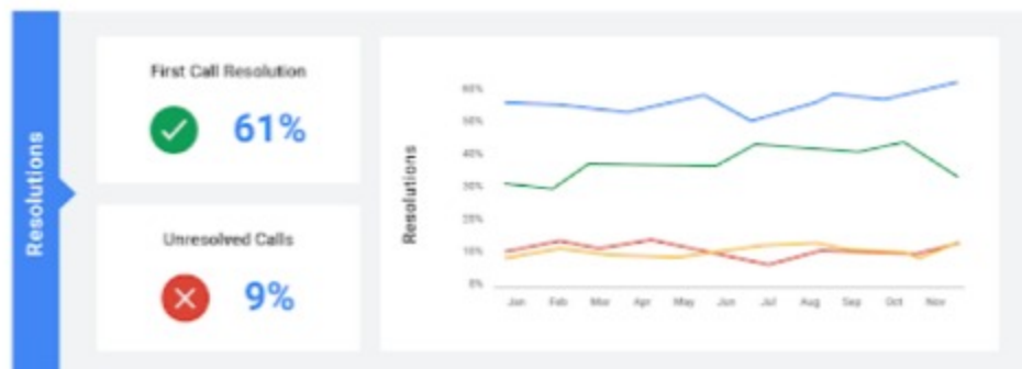
Customer Service Team Dashboard

Operational dashboards are arguably the most common type of dashboard. Because these dashboards contain information on a time scale of days, weeks, or months, they can provide performance insight almost in real-time. This enables businesses to track and maintain their immediate operational processes in light of their strategic goals. An operational dashboard could focus on customer service team performance.